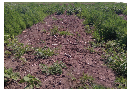
XtendiMax® With VaporGrip® Technology + Roundup PowerMAX®

2018 Syngenta trials; Iroquois, South Dakota. Weeds present: kochia, common cocklebur, lambsquarters, green foxtail.