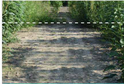
Prefix® followed by Tavium® + glyphosate Four effective SOAs

Images taken 55 days after post-emergence application