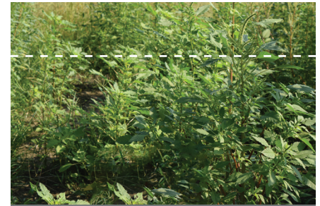
Warrant® followed by XtendiMax® With VaporGrip® Technology + glyphosate + Warrant® Three effective SOAs

2019 Syngenta bare ground herbicide demo; Kinston, North Carolina.