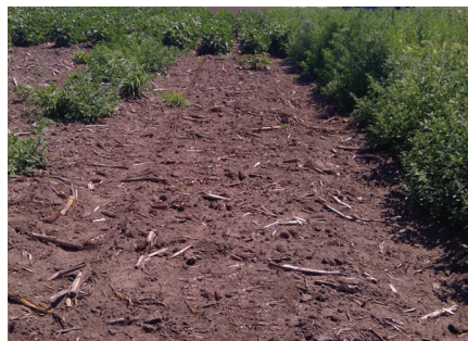
Tavium® + Roundup PowerMAX®